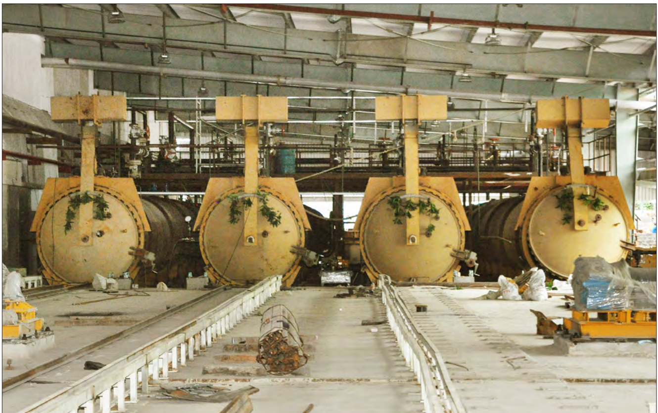
Arakkonam Unit Line 2 - Autoclaves