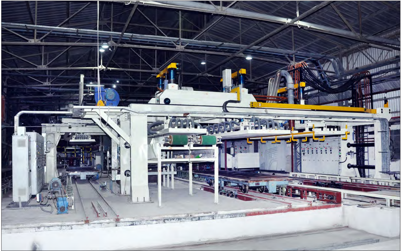
Arakkonam Unit Line 2 - Destacker & Template Piler