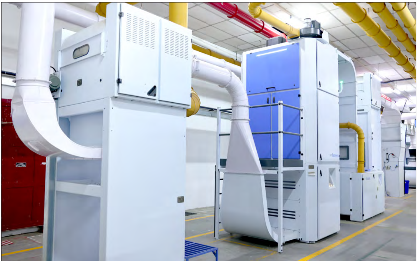
Trutzschler blowroom machines and Contamination detector