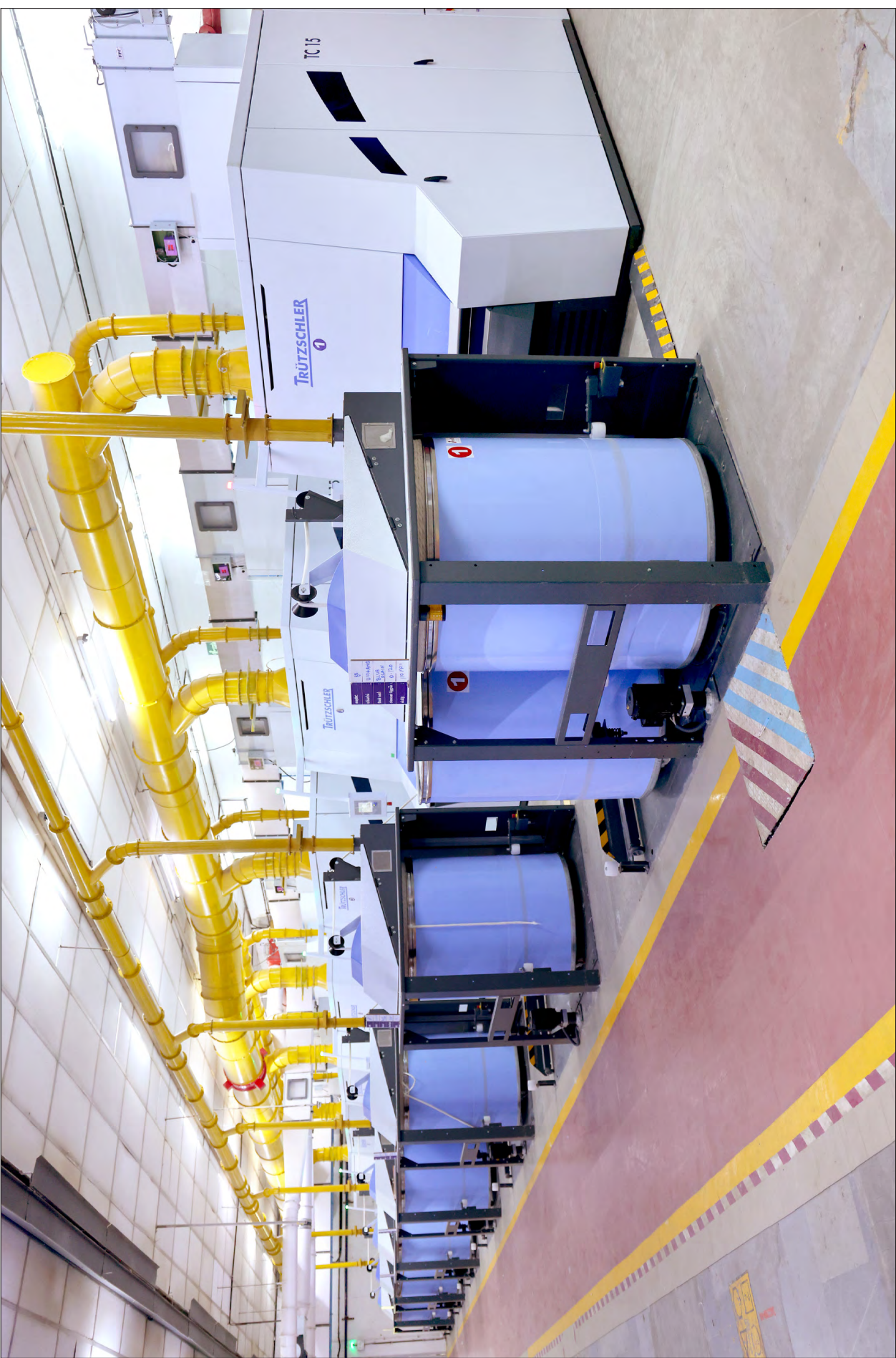
Trutzschler TC 15 model Carding Machine