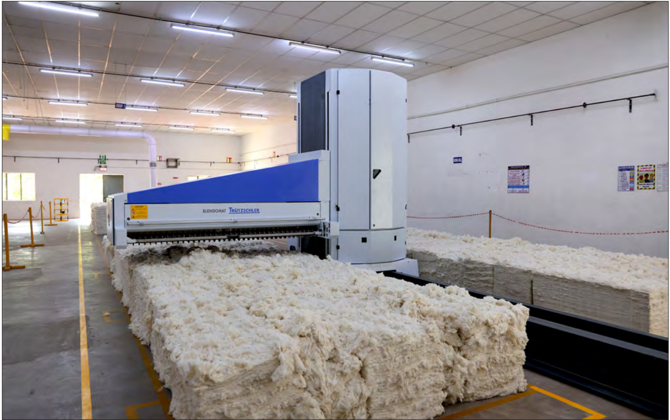
Automatic Bale opener installed in blowroom